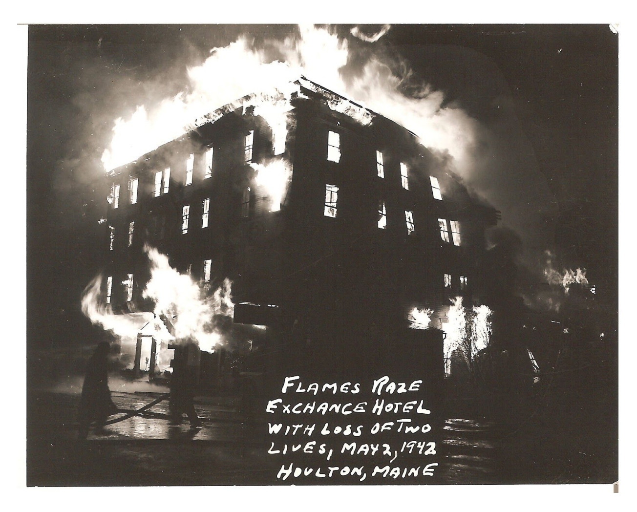
The building was lost to fire in 1942 and not rebuilt.